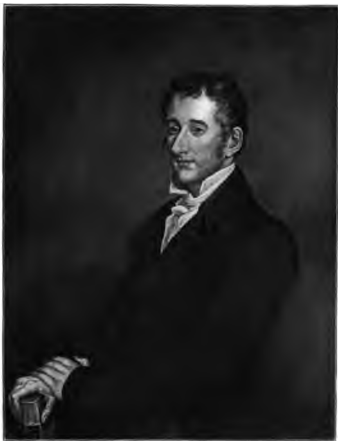
SIR FRANCIS BURDETT, BT., M.P.

From an engraving by Wm. Sharp, after a picture by J. Northcote, R.A. Painted while Sir Francis was a prisoner in the Tower